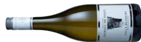
Calmel & Joseph, Villa Blanche 2018 90 AJ 91 JHS 91 MOW 89

‘Picpoul de Pinet is an appellation every Languedoc exporter wants to offer’